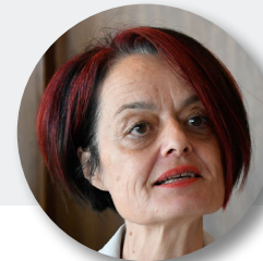
REGIONAL DIRECTOR FOR THE MIDDLE EAST AND NORTH AFRICA, WFP

"Saudi Arabia is an important donor, and not just for Yemen, but globally. What Saudi Arabia is doing for the people of Yemen, we also see in other places. KSrelief is everywhere, and it is the biggest donor of all globally for the people of Yemen, and has consistently been so. This, for me, is an incredibly important partnership. Saudi Arabia will also have a central role to play in the future management of OCHA. From the middle of next year, Saudi Arabia will chair the OCHA Donor Support Group (ODSG), which supports OCHA globally. This is very important to me."