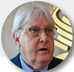
UNITED NATIONS UNDER-SECRETARY-GENERAL FOR HUMANITARIAN AFFAIRS AND EMERGENCY RELIEF COORDINATOR, OCHA